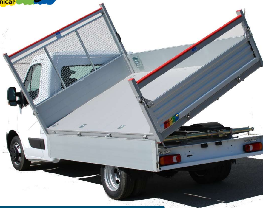
Illustration for informational purposes only - Non contractual