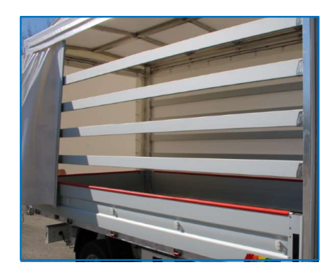
Removable curtainsider structure made of aluminium light alloy, available as OPT.

ONNICAR, ALUMINIUM CONVERSIONS FOR COMMERCIAL VEHICLES