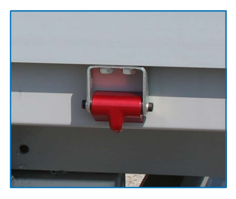
Standard side-panel pivoting system with hook for ropes.