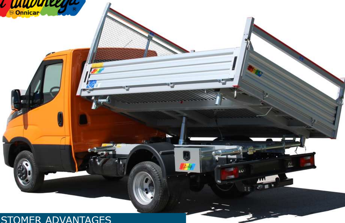
Illustration for informational purposes only - Non contractual