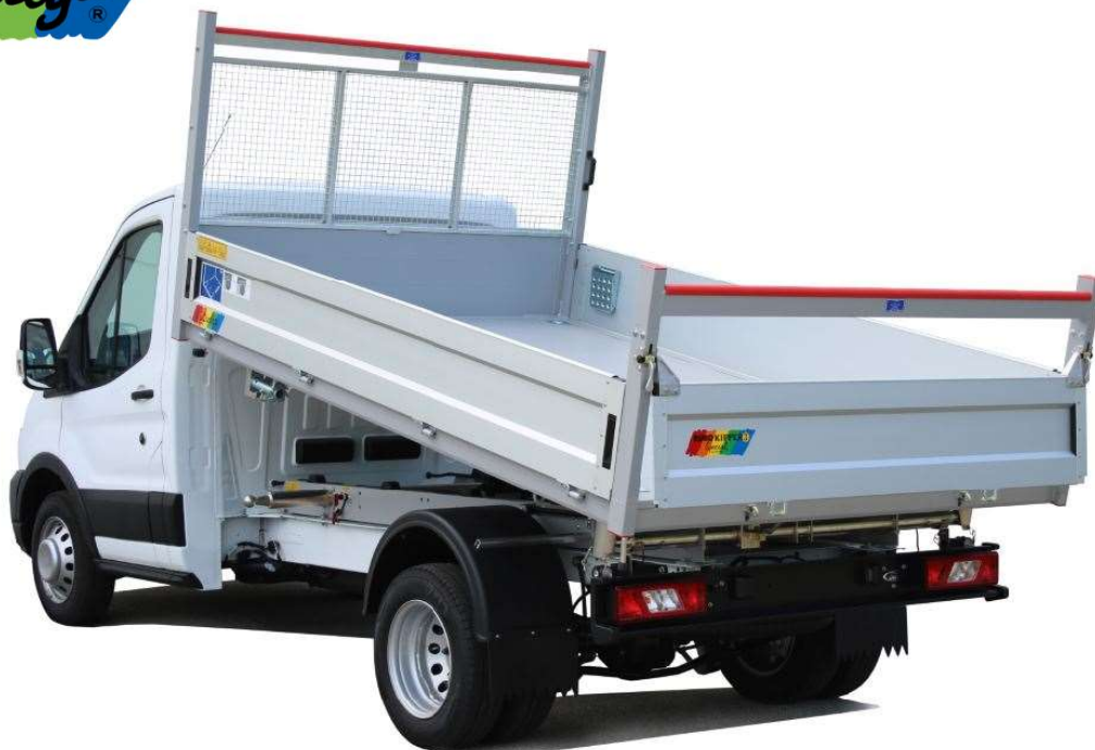
Illustration for informational purposes only - Non contractual