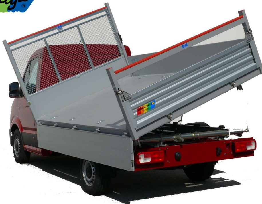
Illustration for informational purposes only - Non contractual