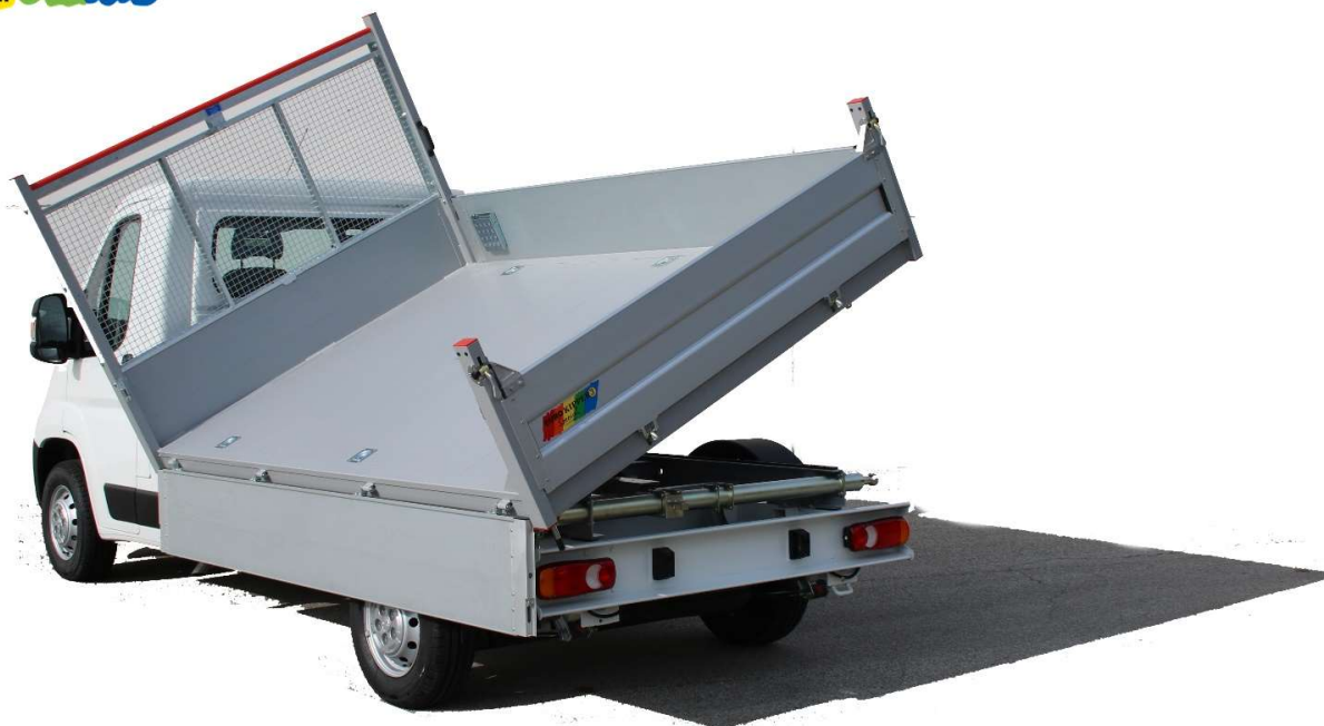
Illustration for informational purposes only - Non contractual